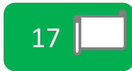
Figure 2. An example of a flagged questions on the left-hand side of the screen.